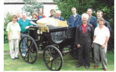
The Bennington Team