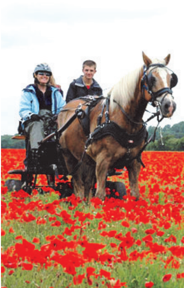
Not long until the warmer weather...

Happy New Year to you all from the Bennington Team. We wish you an enjoyable and successful driving season for 2009.