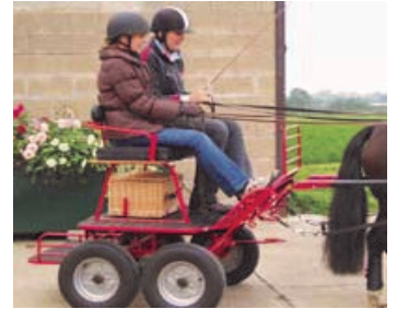
2008 Try Driving